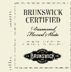
Brunswick Certified Slate